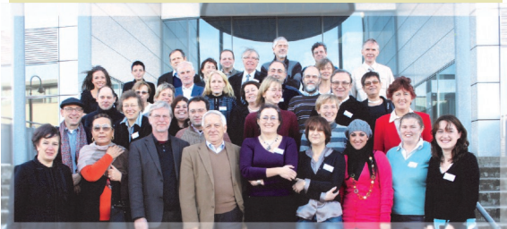
ESTABLISH Kick off Meeting, January 2010, DCU, Ireland

ESTABLISH is committed to being an open-access project. Further information together with educational and training materials from the project will be made available on our website as they are developed.